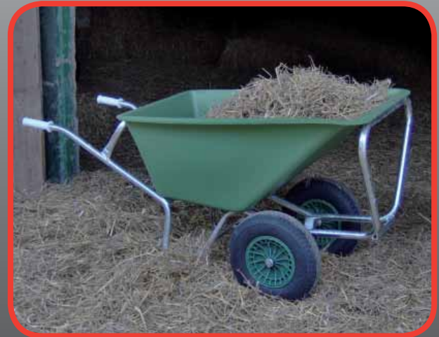
PEX-160 (2 Wheel)