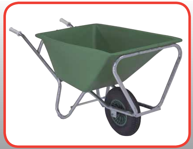
PEX-160 (1 Wheel)