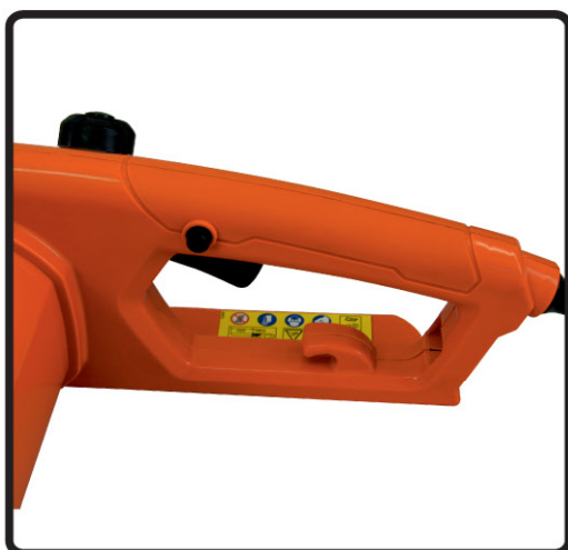
safety switch with switch lock cable strain relief