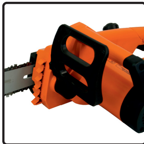
back stroke protection with emergency chain brake < 0.1 sec. practical bumper spikes