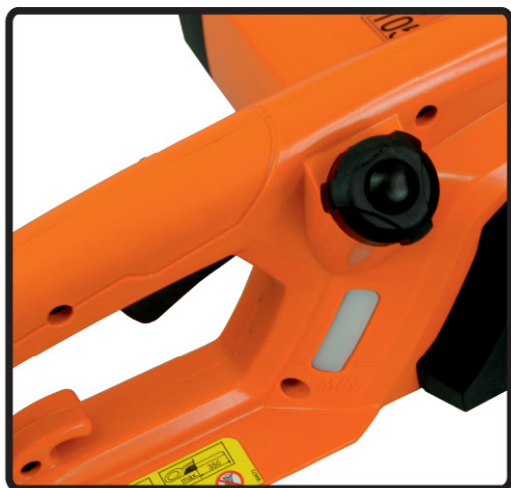
automatic chain oiling oil level indicator oil tank cap with primer

Well suited for easy sawing without exhaust.