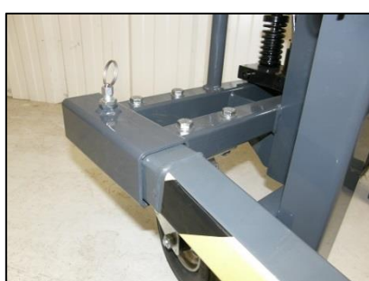
Movable legs, you don't need tool to do it and you gain space in your van