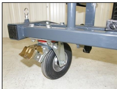
Inflatable wheels \varnothing 200 mm, including 2 pivoting wheels with brake