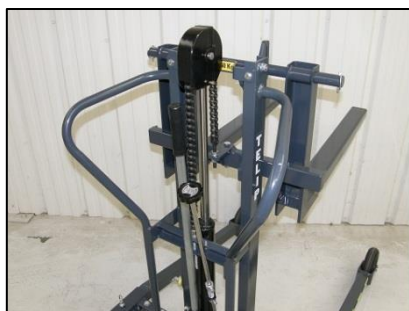
Manual hydraulic group, very easy to use, you pump with the arm and you release the handle to lift down