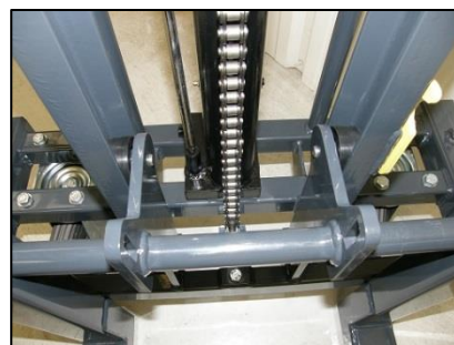
Very strong carriage guides with 4 rollers