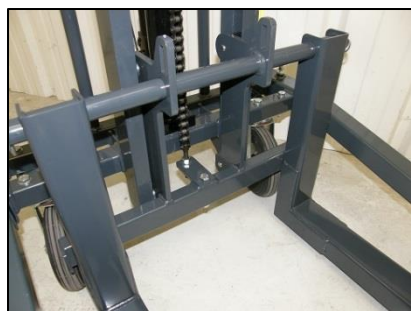
Adjustable forks, you can move it and you can disassemble it very quickly